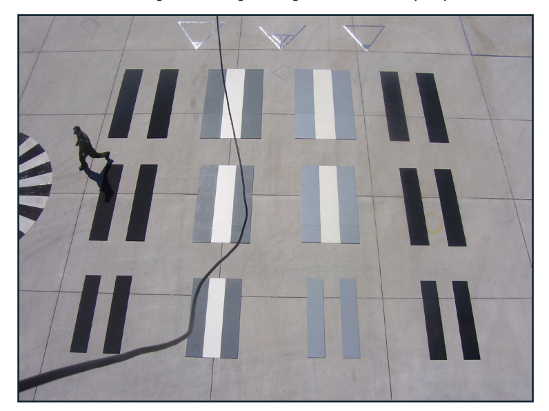
Figure 4 Passive thermal targets for geometric resolution determination of Open Skies infrared sensors during a test data gathering at Eskisehir, Turkey, September 2006

Notes: five of the grey bar groups in the centre have a central bar painted white that serves as a contrasting background. The dark line is a cable in front of the camera.