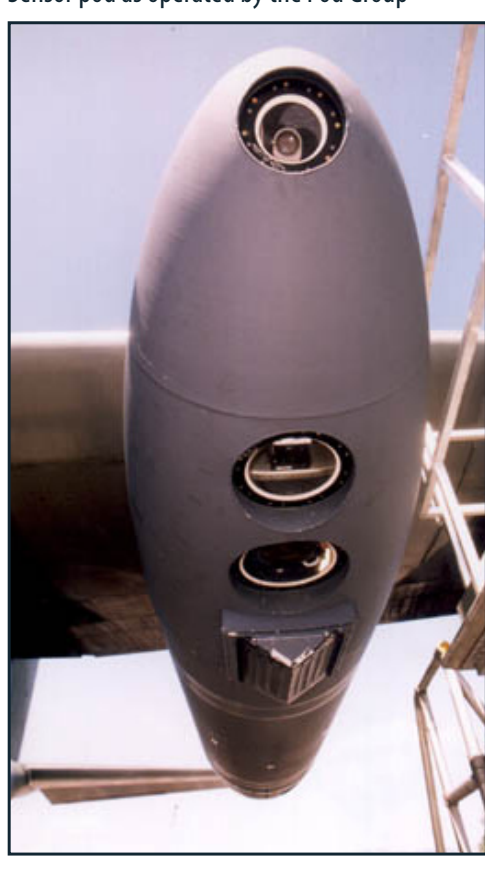
Notes: the sensor pod is attached to the wing of a C-130 aircraft. A video camera is mounted in the nose of the pod. Behind this, on the underside of the pod, are windows for the KS-116 panoramic camera and the nadir-pointing KS-87B camera, followed by two windows for the two KS-87B cameras pointing obliquely to the left and the right.