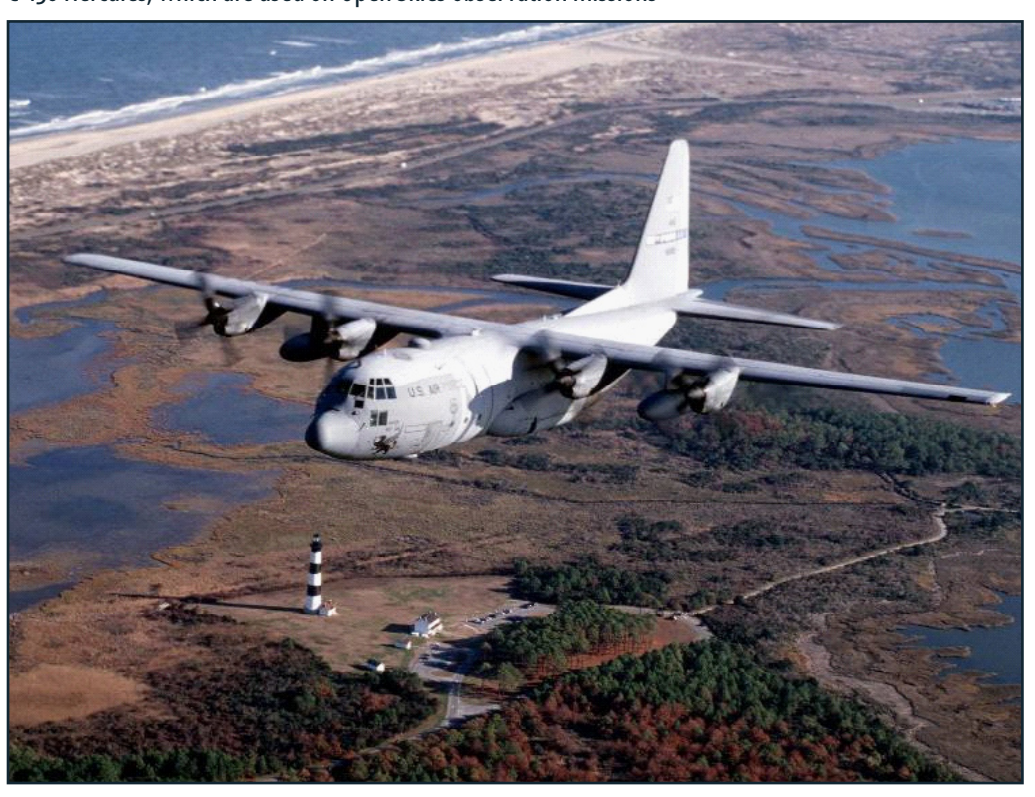
Figure 1 C-130 Hercules, which are used on Open Skies observation missions